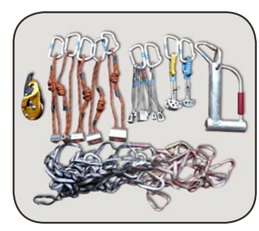
Rigging hardware and Slings