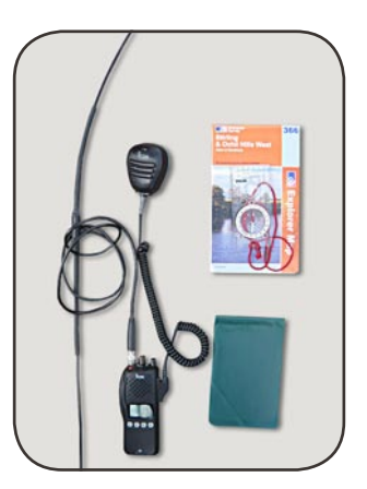
Navigation and Comms