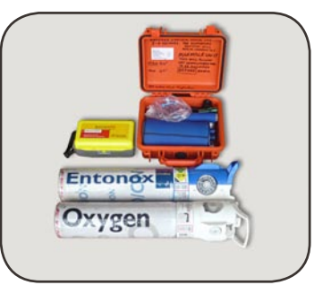
Oxygen, Entonox, Defibrillator and Little Dragon