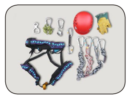
Helmet, Harness and Climbing Hardware