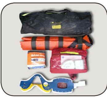
1st Aid, Splints and Collars