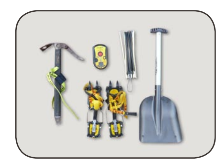
Ice Axe, Crampons, Snow Shovel, Avalanche Transceiver and Probe