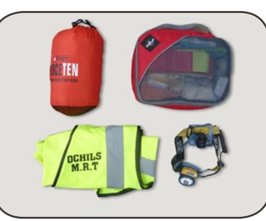
1st Aid, Emergency Shelter and Safety Equipment