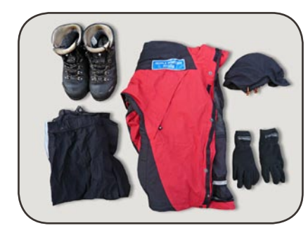
Boots and Outdoor Clothing

Founded 1971 - A Scottish Charity SC024517. Affiliated to the Mountain Rescue Committee of Scotland