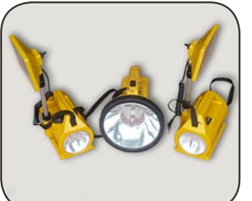
Torches and Lamps