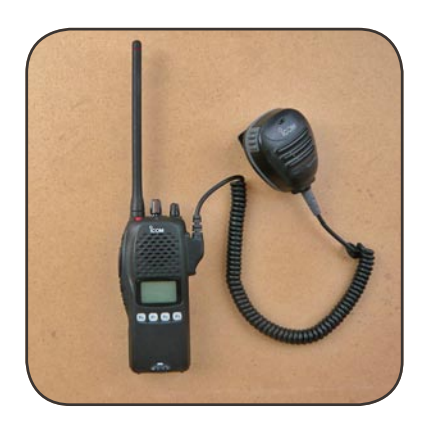
8-Ochils MRT Association